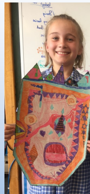
Based on the work of Kimmy Cantrell