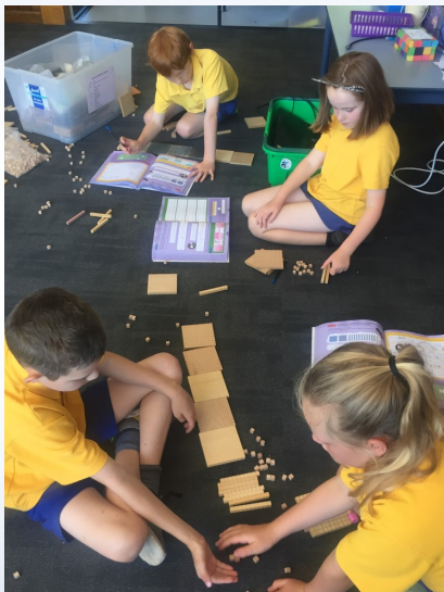
Subtraction work with MAB Blocks to help us with place value