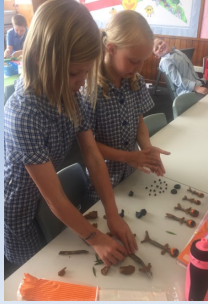
Diorama making for our History unit