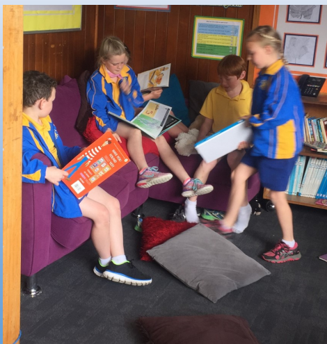
Enjoying the reading corner