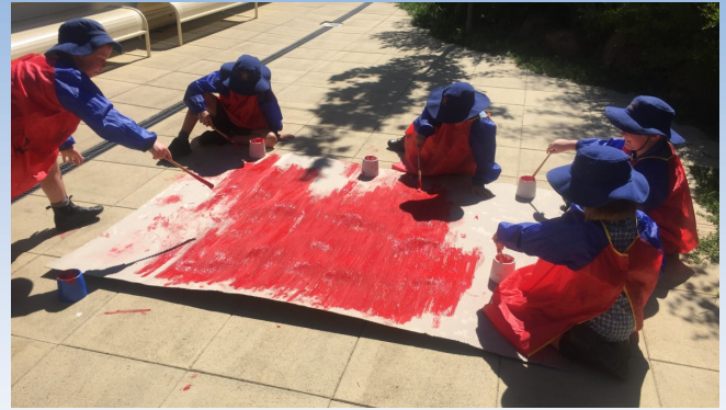
Beginning to get organised for Santa's Workshop