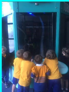
Visiting the Phenomena Factory