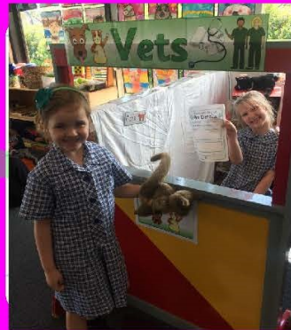
Playing in the Vet