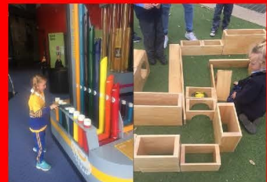
Visiting the Phenomena Factory and programming Bee-Bots