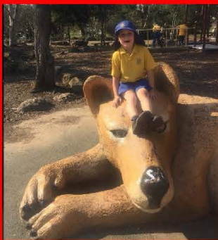
Visiting Heritage Forest