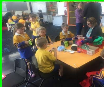
Visiting the museum